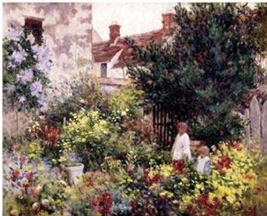
— Camille Pissarro, date unknown