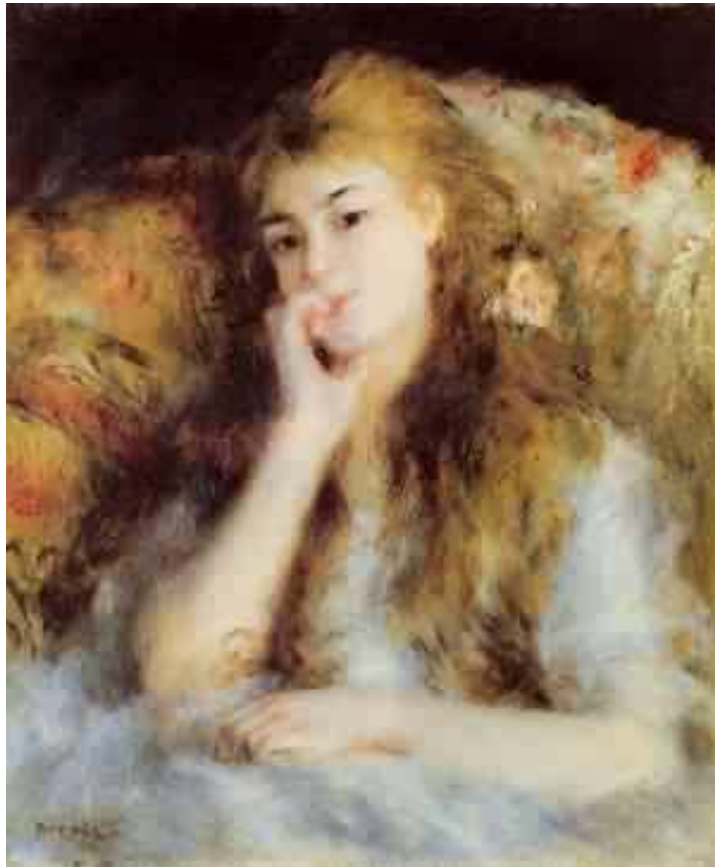
— Pierre-Auguste Renoir, 1877