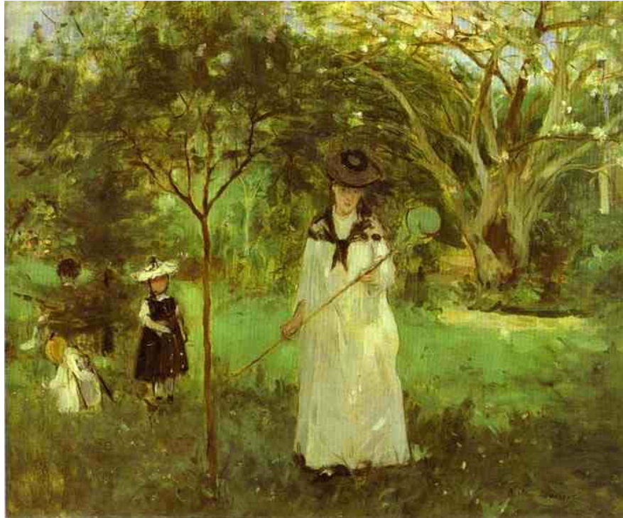
— Berthe Morisot, 1874