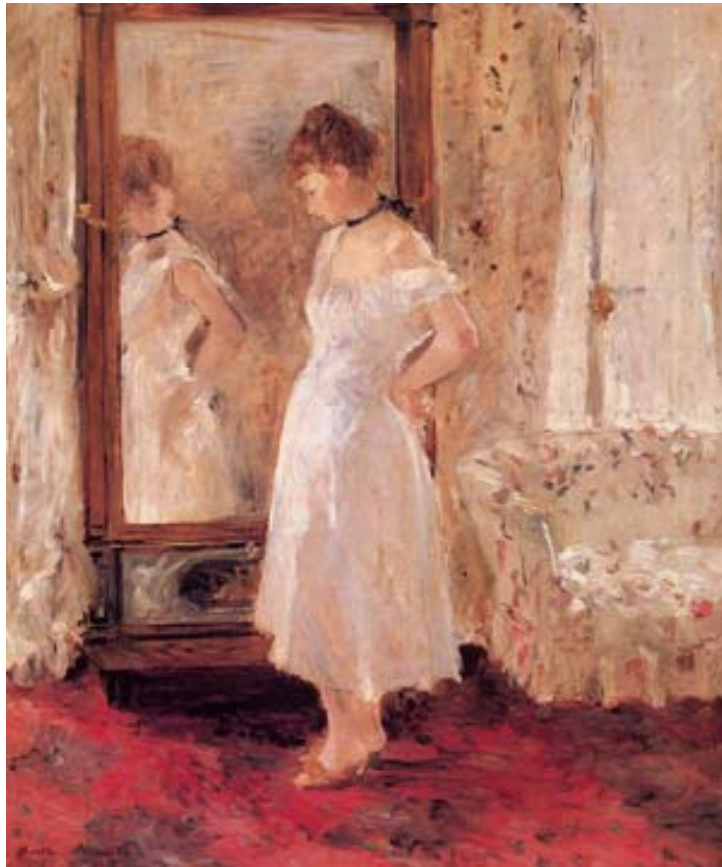
— Berthe Morisot, 1876